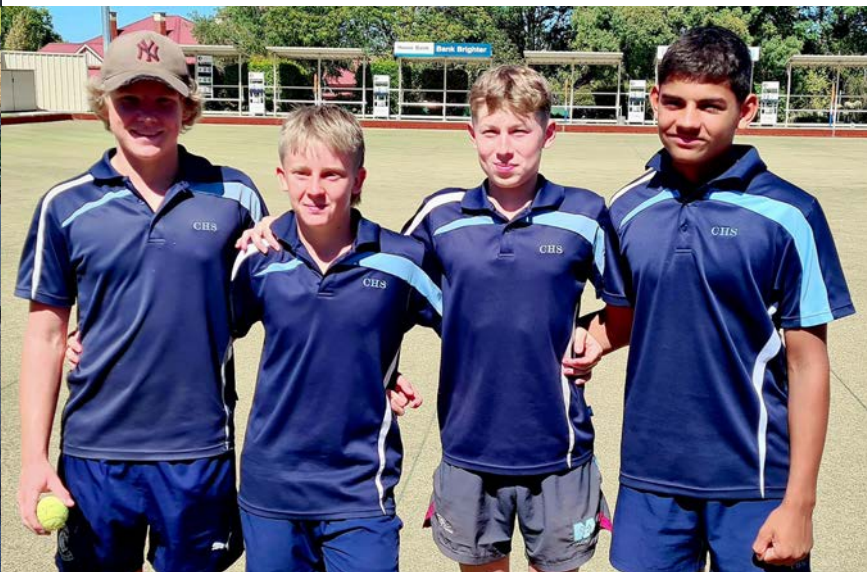
Table tennis team face tough competition

Corowa High finished on top with the final score being 12-10. We were very appreciative of the support we received from the RSL members.