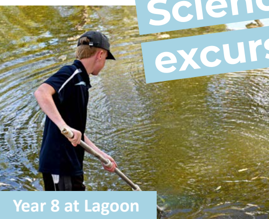
Year 8 at Lagoon