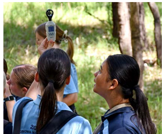
Senior Biology fieldwork